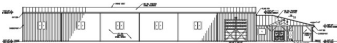
View from the driveway of building main entrance

inviting for families as possible! We can't wait to see it all start to take shape this summer!